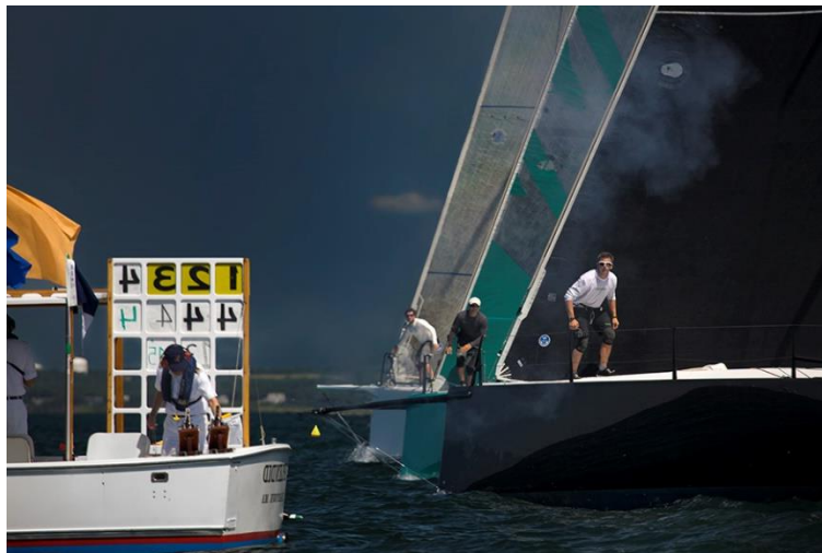
IRC 52s at Edgartown Race Weekend's 'Round-the-Buoy Races in 2014.

EDGARTOWN, MASS., MARTHA'S VINEYARD (March 18, 2015)— It really can't get any better – two days of 'Round-the-Buoy Races in dependable breezes on outer Edgartown Harbor followed by a legendary 'Round-the-Island Race that circumnavigates the breathtaking 100-square-mile island retreat of Martha's Vineyard.